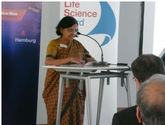
The opening address by Ms. M. Subashini, the Consul general of India at Hamburg.