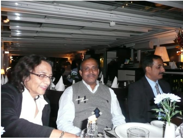
Dinner with the guests from India on the "Binnen Alster".