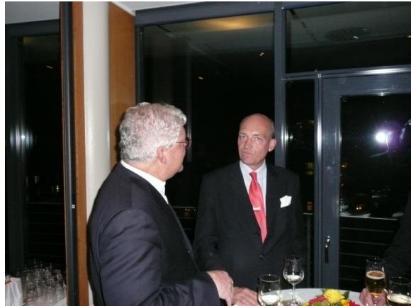
The Networking Evening Reception at the Hotel Hafen Hamburg on 20 th October, 2011